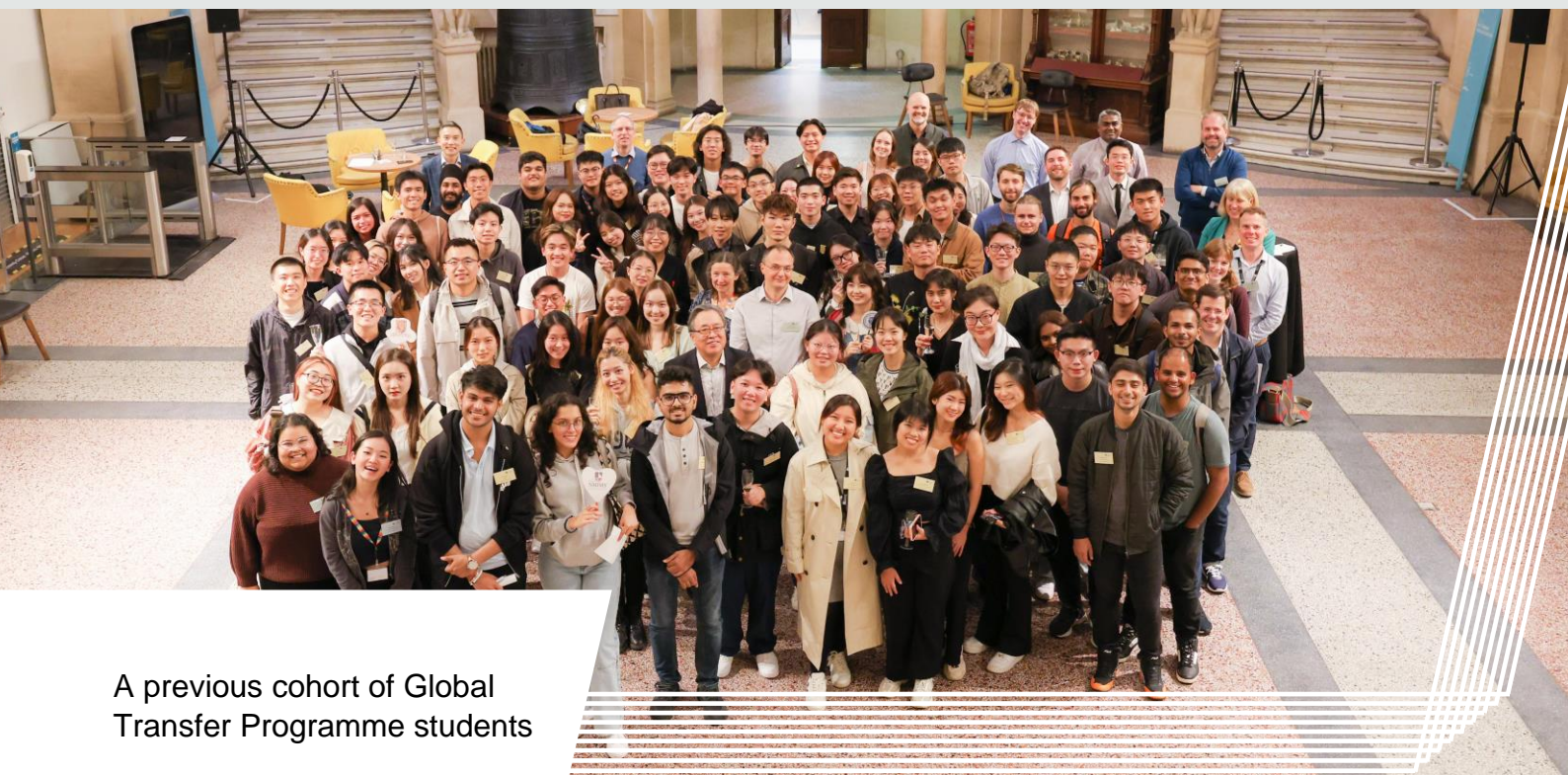
A previous cohort of Global Transfer Programme students