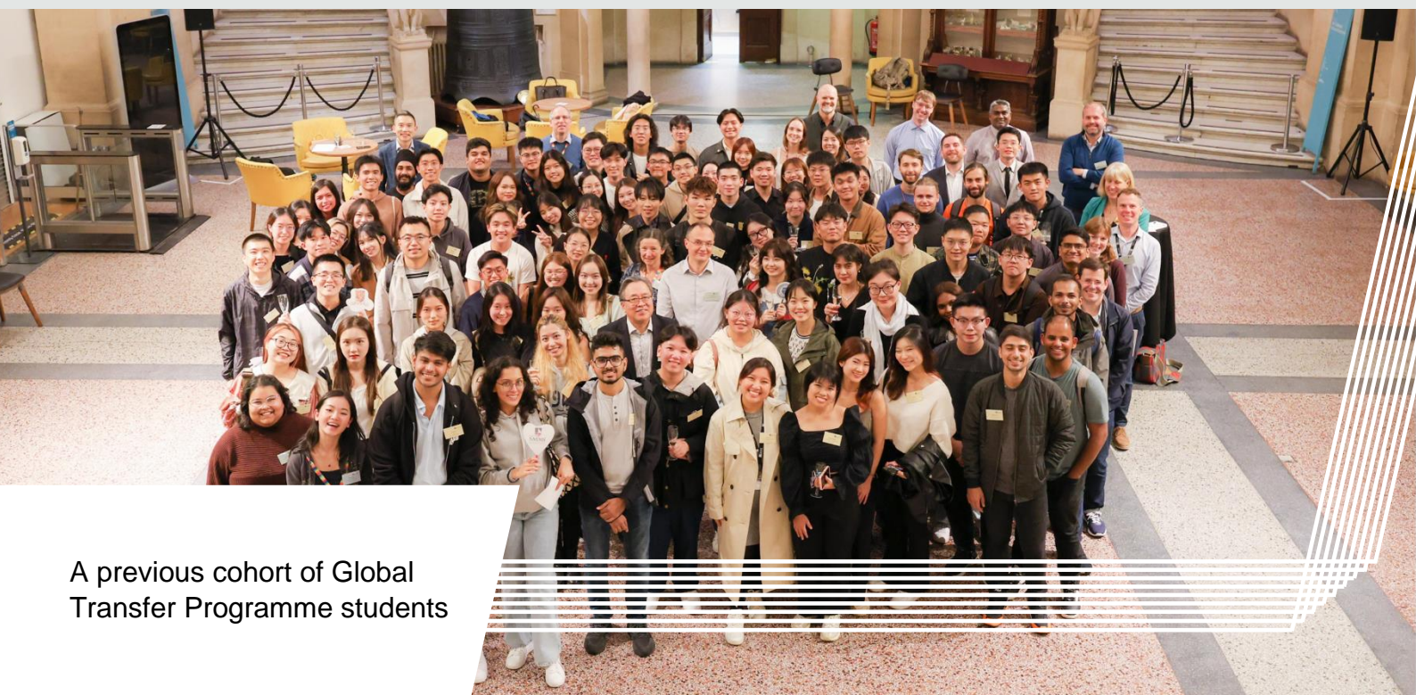
A previous cohort of Global Transfer Programme students